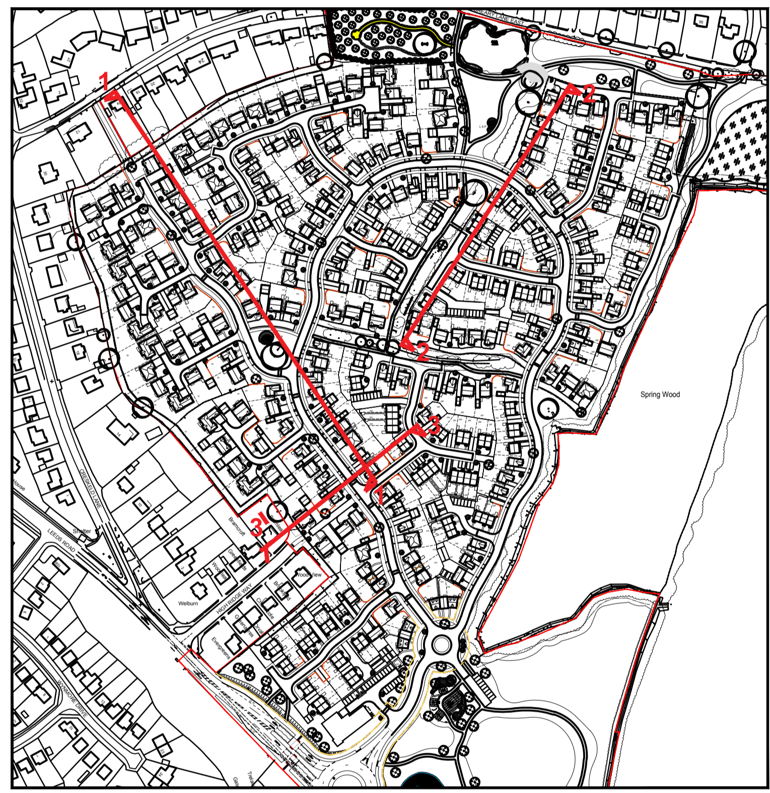
Section Location Plan - Not to scale