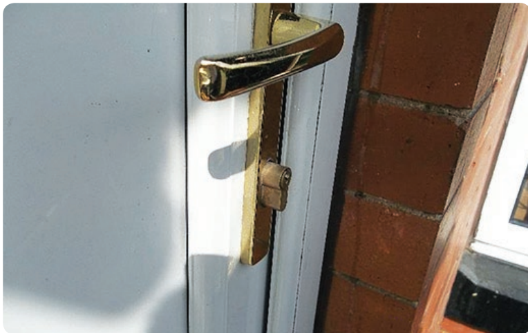
◀ Incorrectly measured lock protruding from the door handle

Contact your local Crime Reduction Officers for any further advice, simply call 101 or email: LeedsCPO@westyorkshire.pnn.police.uk